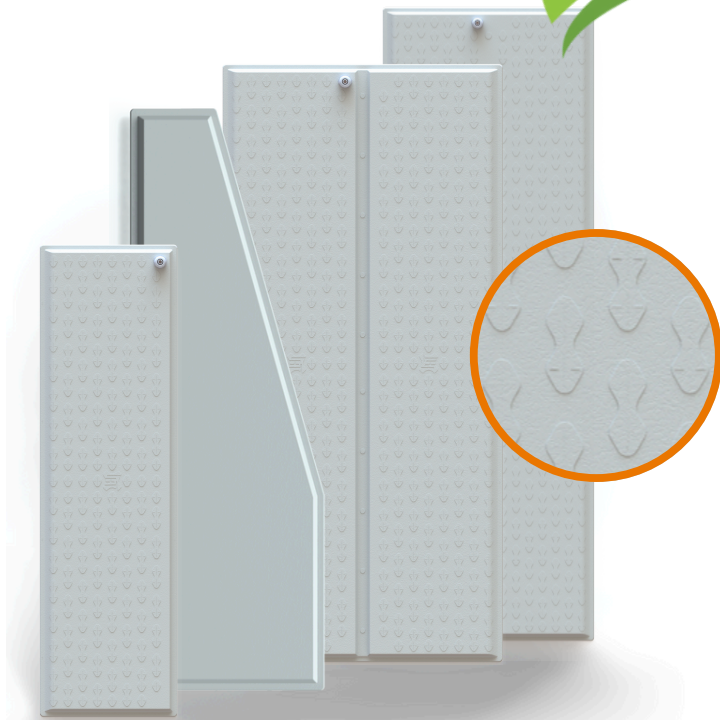
Hog Hearth Accessories: