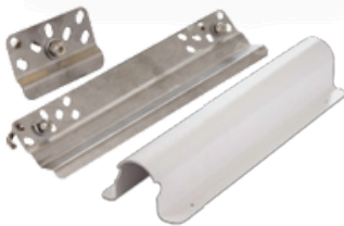
Mounting Brackets & Cord Protector