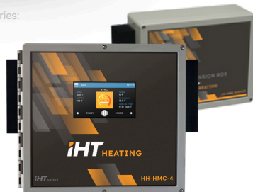
HMC-4 & HH-HMC-4-EX20